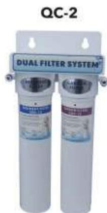
6.3" w x 3.9" d x 13.4" h