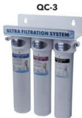
11.8" w x 4.5" d x 14.3" h