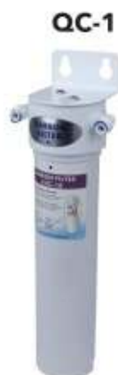
2.8" w x 3.2" d x 12.4" h