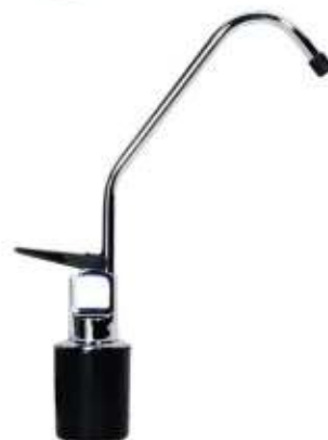
Standard chrome faucet included. Designer faucets available.